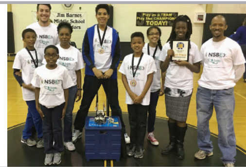
AWARD-WINNING NSBE JR. TEAM